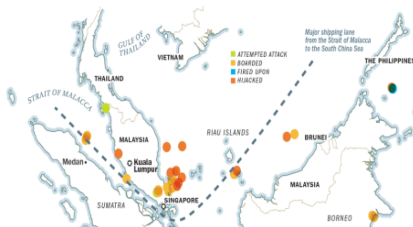
Fig 4. The strategic position of the Riau Islands with regard to the main shipping route through the region (and indication of conflict incident points)

Disputes concerning the North Natuna Sea could potentially flare into open armed conflict due to three reasons. 1) parties engaged in such disputes frequently use military instruments to pursue their claims. 2) there are countries