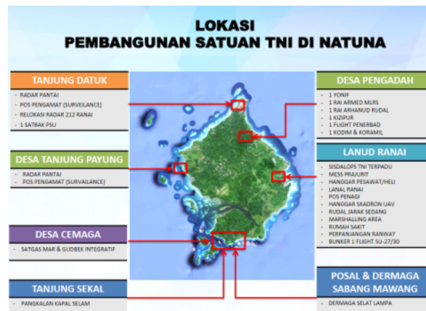
Fig 5. Location of military units in Natuna

According to Van Evera (1998), there are several factors that influence the state in policy-making relating to its defensive force - including military, geographical, socio-political and diplomatic ones. These four factors directly influence defense policy formulated by a country, and the defensive force of a country will always reflect these four factors. In Indonesia's New Order Era (1966-1998) national policies focused on developing land defense forces, neglecting the nature of the country as an agglomeration of islands and marine spaces.