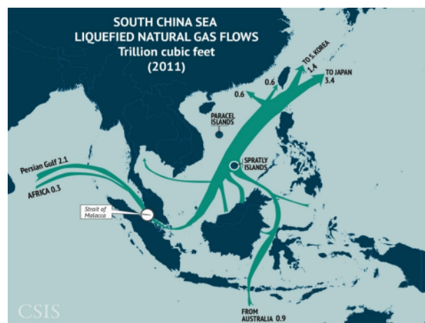
Fig 2. Routes of ships carrying liquefied gas through South China Seas