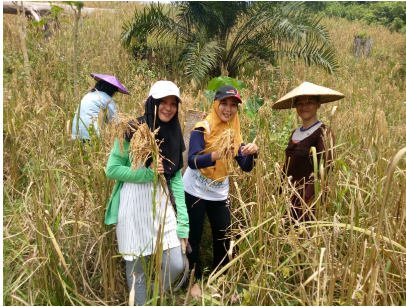
Fig 5. Harvesting in upland paddy field