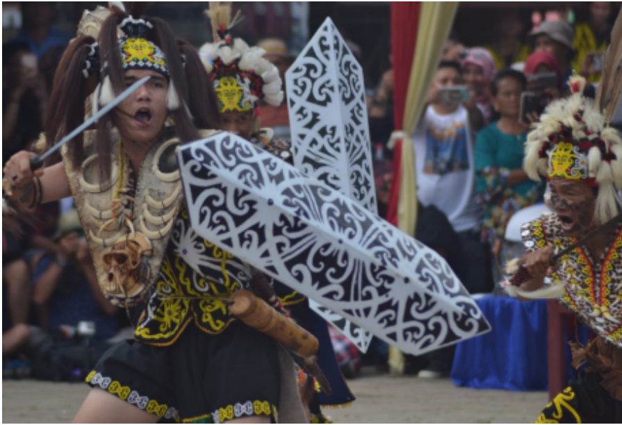
Fig 3. Cultural events as main tourism attraction in Pampang Village